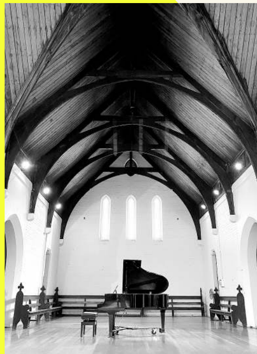
Parish Hall Holy Trinity Church, Fortitude Valley