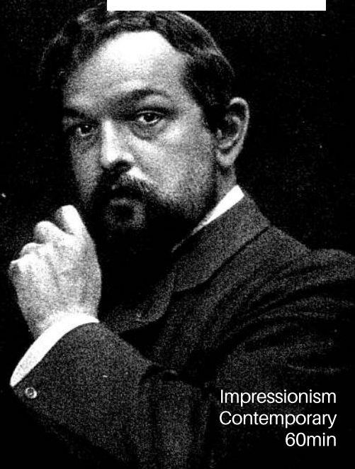
Impressionism Contemporary 60min